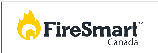
Logo with dark type on a light background

In order to ensure legibility of the logo, situate the logo on a high-contrast background. When placing the logo on a light background, use the logo with the brand-grey font. On a dark background, use the logo with the white font.